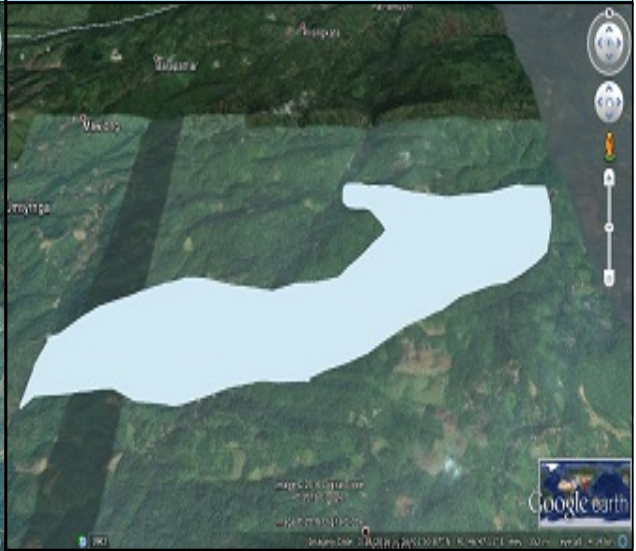
Google Satellite view