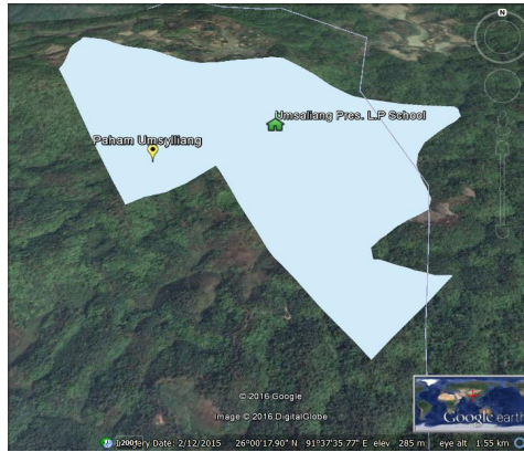
Google Satellite view