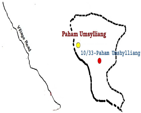
Part Boundary Map