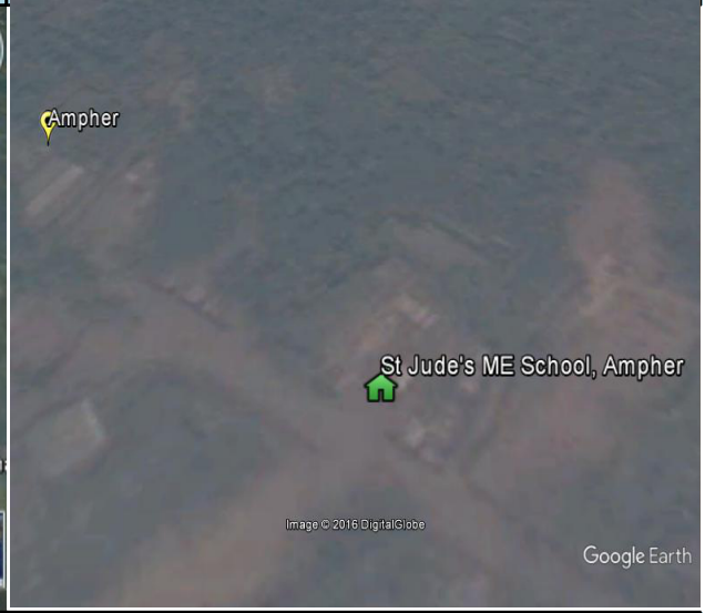
Google Satellite view