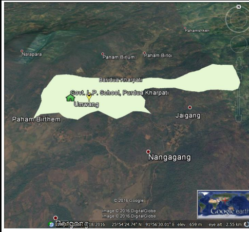
Google Satellite view