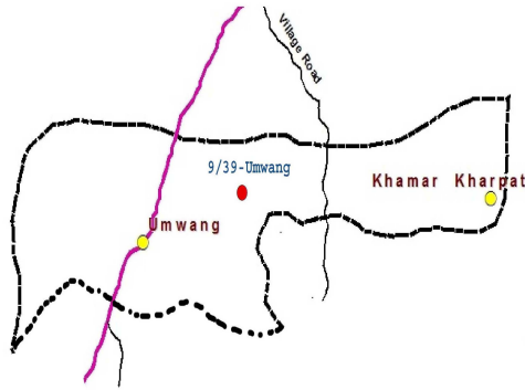
Part Boundary Map