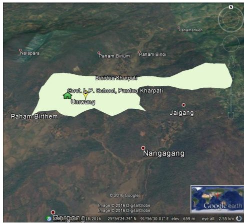
Google Map View