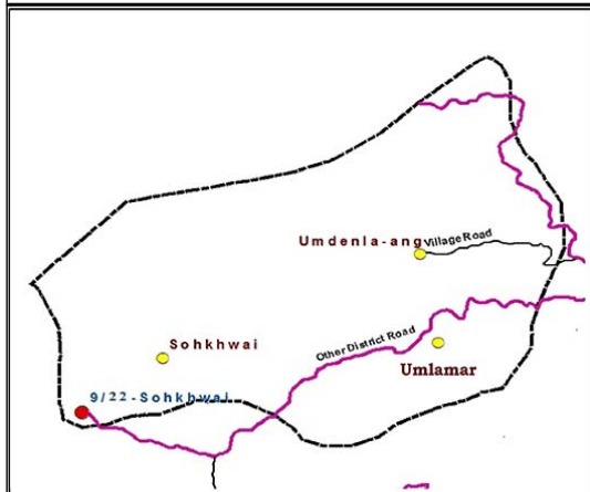
Part Boundary Map