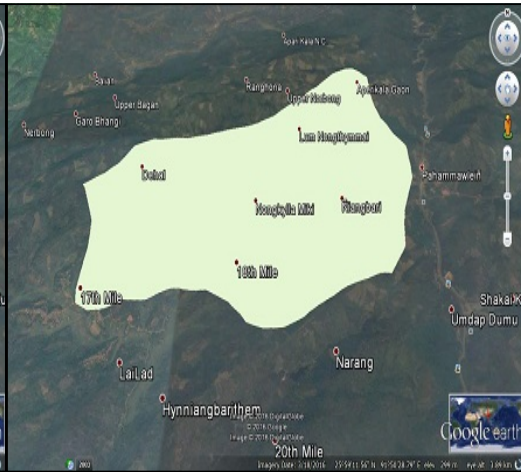
Google Satellite view