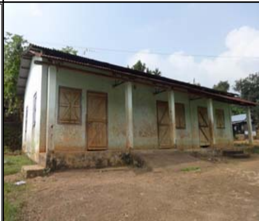
Building Front View